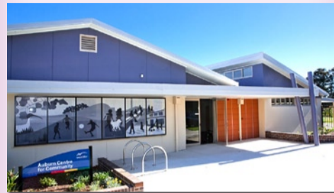
AUBURN CENTRE FOR COMMUNITY Corner of Macquarie Rd and Hutchinson St, Auburn