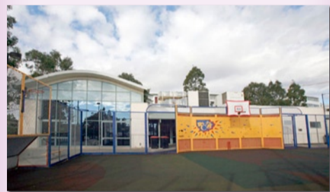
NEWINGTON COMMUNITY CENTRE Corner of Avenues of Europe and Asia, Newington