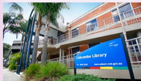
LIDCOMBE COMMUNITY CENTRE 3 Bridge St, Lidcombe (underneath Lidcombe Library)