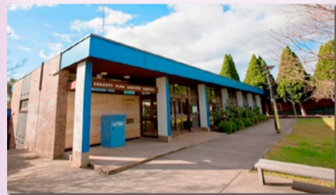
REGENTS PARK COMMUNITY CENTRE Amy St, Regents Park (behind Regents Park Library)