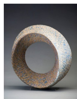
En, 2009 - Mitsuo Shoji